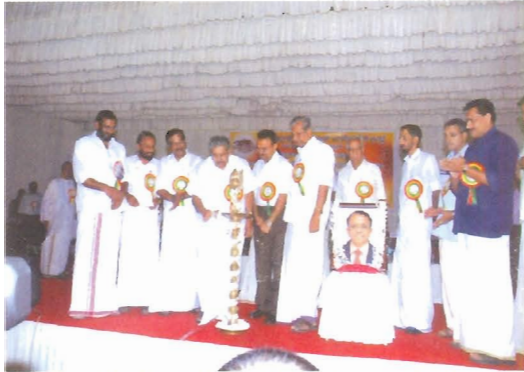
Sri. Vayalar Ravi, Hon'ble Minister of Overseas Indian Affairs, inaugurating the anniversary celebrations by lighting the lamp