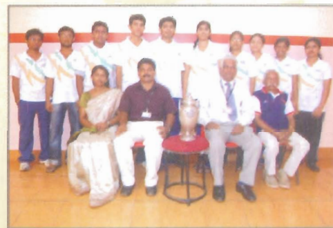
Vidya Table Tennis Team with Calicut University Intercollegiate Table Tennis Trophy

Vidya Academy of Science and Technology successfully organized the Calicut University Intercollegiate Table Tennis Championship (Men & Women) 2010-11 at the campus during 08 -09 September 2010. 17 colleges affiliated to the university took part in the two day event.