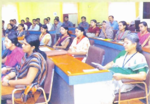
Participants of the induction programme