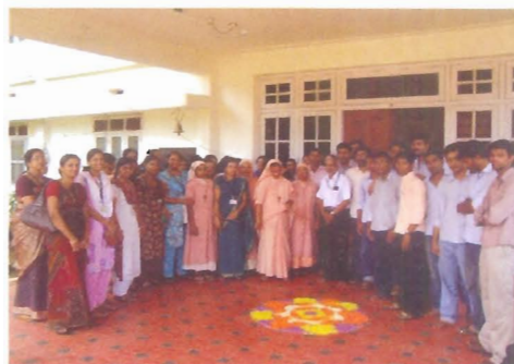
MCA students and staff with the inmates of Grace home, Peringandoor, Athani

Fourth Semester MCA students and staff of the Department of Computer Applications visited Grace Home, Mar Kundukulam Memorial Research and Rehabilitation Complex, Peringandoor, Athani, on 19 August 2010 on a charity work. The institution shelters more than 60 persons identified as HIV positive. They include about 30 children most of whom are orphans.