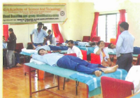
A view from the blood donation camp

63 volunteers donated blood and 137 students got blood group identified.