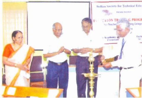
The inaugural function

ISTE Kerala Section conducted a training programme on “TEACHING EXCELLENCE AND METHODOLOGIES” for teachers in Engineering Colleges in the State during 02 - 07 August 2010 at Vidya Academy of Science and Technology, Thrissur.