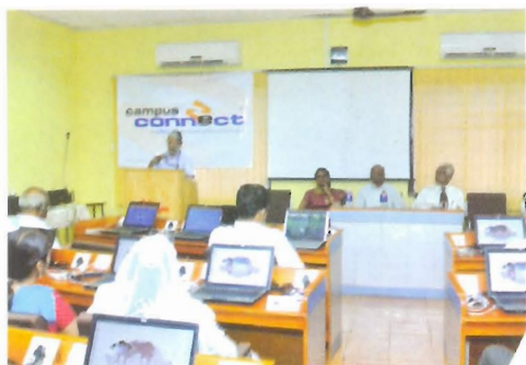
From the inauguration of the workshop on J2EE Technologies

jointly organized a faculty enablement workshop in J2EE Technologies on 29-30 July 2010. The workshop was organized in collaboration with the Campus Connect team of Infosys Technologies Ltd.